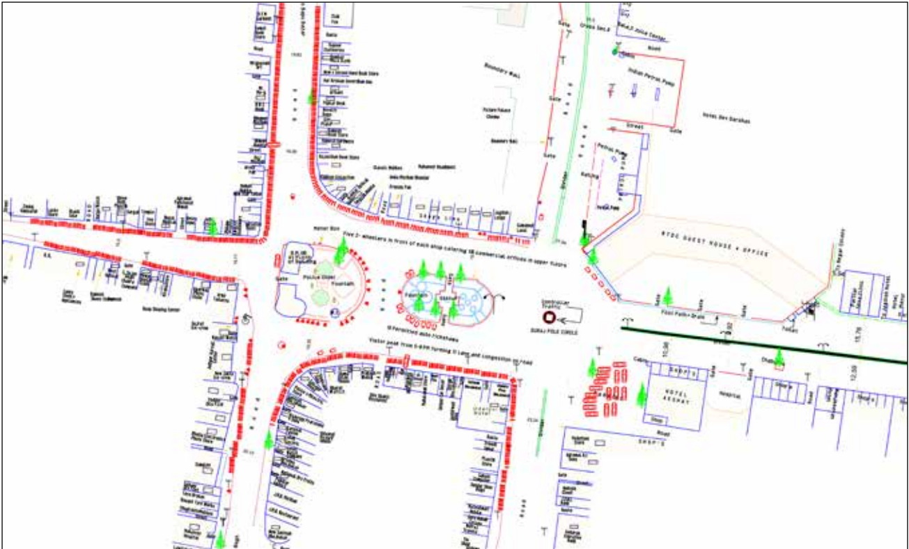
Figure 1.: Suraj Pole Junction

all stakeholders, including Udaipur Municipal Corporation and local traffic police, the following design requirements were finalized for Suraj Pole: