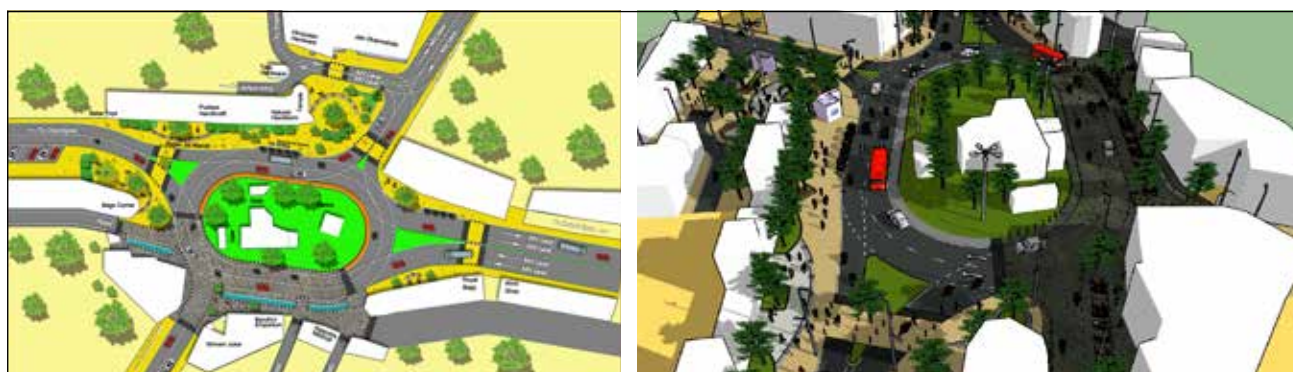
Figure 9.: Hathi Pole - Design Proposal and View

Like the redevelopment approach for Suraj Pole and Delhi Gate junctions, Hathi Pole Redevelopment plan followed a process of stakeholder interaction, and an intended-on site demonstration of the plan. Based on multiple meetings and presentations conducted with different stakeholders, including Udaipur Municipal Corporation, Traffic Police and elected representatives, a design brief for Hathi Pole was developed. Activity mapping, data collection, including total station survey and traffic counts was also conducted for the same.