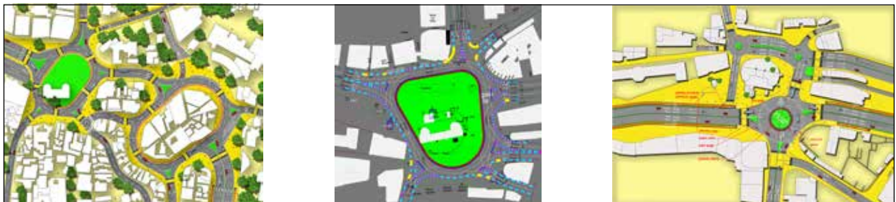
Figure 6.: Design Transition Delhi Gate - A. Initial proposal (Left), B. Modified Proposal (Center) and C. Final proposal (Right)

As per the design brief and data analysis for Delhi Gate, a large oval roundabout was suggested at this intersection. This roundabout combined the cluster of junctions at this location into one large roundabout. This was proposed along with a revised circulation plan for the surrounding road network – Proposal A (Figure 6). The proposal was later modified to allow experimentation on site using temporary barricades. The proposal constituted improvement of the current rotary around the historic Delhi gate structure along with signal free traffic circulation - Proposal B (Figure 6). This proposal was executed on the site, but did not work well because of a construction on the western edge. Thus, the proposal was reverted to cluster of junction design, with redevelopment of all three junctions to passive controlled intersections using roundabout - Proposal C (Figure 6). Experiment for this proposal was conducted, involving the main junction, which was the most traffic intensive junction of the three (Figure 7).