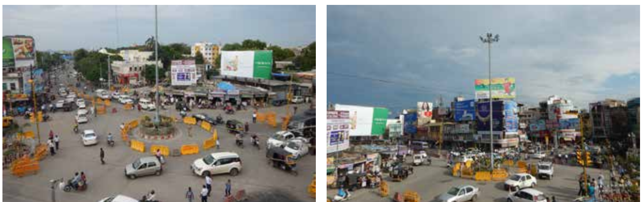
Figure 7.: Delhi Gate - During Experimentation