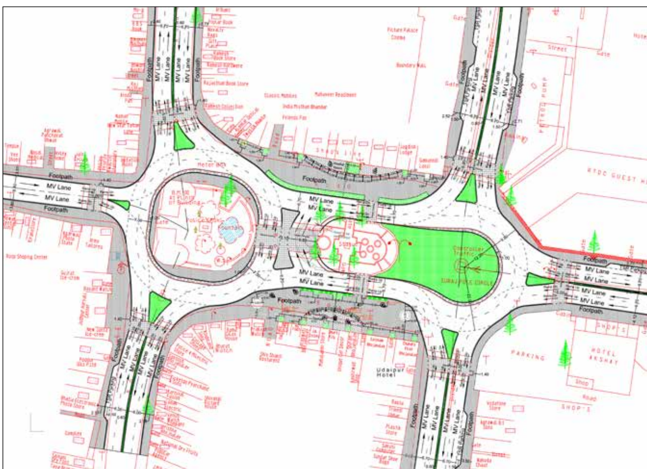
Figure 3.: Design Proposal – Suraj Pole

The traffic entering the two junctions varies between a low of 1,095 PCU per hour per direction from Bapu Bazar Road and a high of 3,316 PCU per hour per direction from Airport Link Road. Since the peak capacity in urban conditions is suggested as 2,000 PCU per hour per lane, it is evident that two lane carriage-way for each direction traffic on roads feeding the intersection is sufficient to cater to current demand. However, between the two junctions, the available width is more than twice required for a two-lane carriageway (6.7 m). Thus, by proposing a junction geometry in line with the current demand, a demarcation was created on the current 9.8 m wide carriageway between the junction, which leaves near about 13 m width on either side to be developed as landscaped pedestrian realm, parking and vending spaces. The proposed design for Suraj pole intersection is presented in Figure 3.