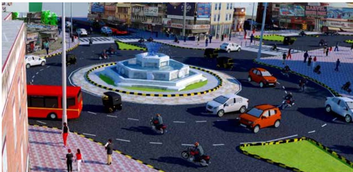
Figure 8.: Proposed View - Delhi Gate

The revised design - Proposal C (Figure 6) was presented to the stakeholders and it has been decided that another full experiment will be conducted on site with more permanent nature of the barricades. The final design incorporates through continuous pedestrian movement aided with raised crossing. Dedicated vending zones are proposed to be provided, along with twin parking system in front of Taibiyah School, with a capacity of 50 cars and 31 two wheelers. This arrangement promised organized and calmed movement for all.