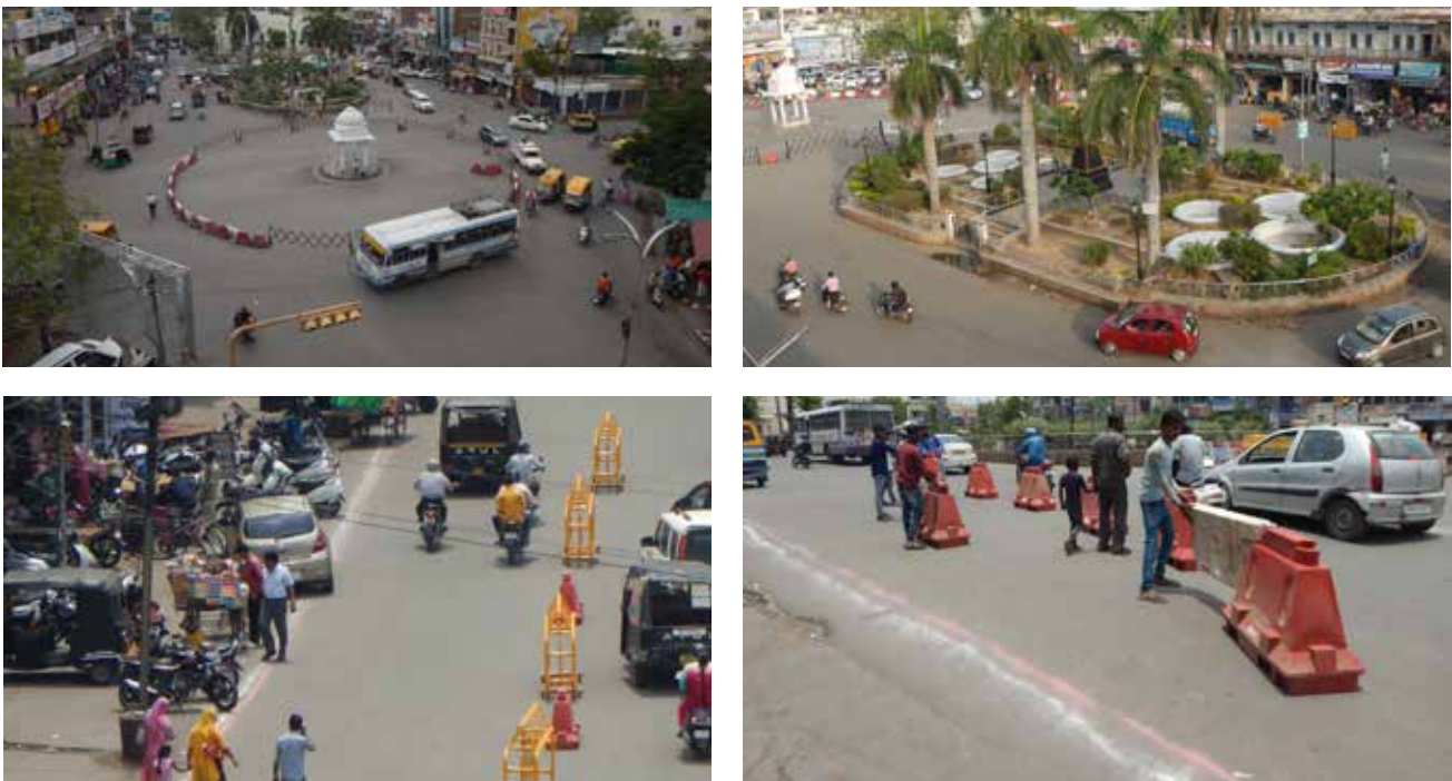
Figure 5.: During Experiment at Suraj Pole

Suraj Pole junction design was modelled practically on ground and has been running successfully for six months, with much appreciation from all walks of society, city, traffic administration and media. People have appreciated the initiative not only by following the planned traffic movement, but have also developed an insight towards traffic improvement ideology. This laid the trust in the design solution of roundabout as a junction improvement. Public now believes in a possibility of larger benefit over long term through classification and segregation of available road space to meet requirement for all modes. Figure 5 below presents some glimpses during the Suraj Pole junction experiment.